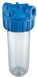
SENIOR PLUS 3P TS

2.5" housings fit to CPP SP filter cartridges