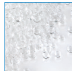
Glassy polyphosphate beads