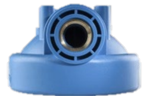
DP BIG Plastic Housing Gauge & Drain Connections Lead-free Brass Inserts Filter Housing Wrench Metal Bracket Lubricant Sediment 5-micron Filter Cartridge