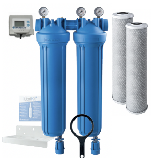
DP Big DUO Plastic Housing Metal Powder-coated White Bracket Filter Wrench and Lubricant

Atlas Filtri is driven to providing our customer with the best available products to meet specific filtration requirements. This is done by using the most advanced manufacturing and design methods. The international patents received come from a constant commitment to research and develop that result in new and innovative products.