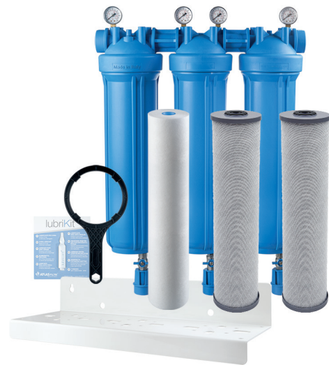
DP BIG Trio Plastic Housing Metal Powder-Coated White Bracket, Filter Wrench, and Lubrikit+ 5 Micron Scale and Corrosion Reduction* Filter 1-Micron Carbon Block Filter certified to reduce PFOA/PFOS, Chlorine Taste & Odor* and Chemicals*

Check out more about Atlas Filtri at atlasfiltri.com .