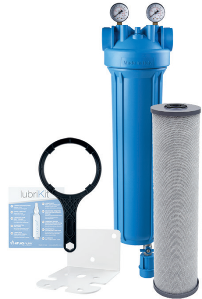
DP BIG Mono Plastic Housing Metal Powder-Coated White Bracket, Filter Wrench, and Lubrikit+ 1-Micron Carbon Block Filter certified to reduce PFOA/PFOS, Chlorine Taste and Odor* & Chemicals*

Check out more about Atlas Filtri at atlasfiltri.com .