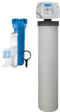
Part Number: ZS7000002