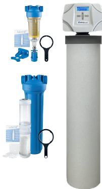
Part Number: ZS7000001

IAPMO Certified for Scale Reduction units under the ScaleArmor™ brand