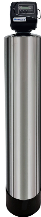
Chlorine/Chloramine Backwash Filtration System with Magnetic Scale Reduction Device Part Number: BW-MC-1MPT-10

Check out more about Atlas Filtri at atlasfiltri.com .