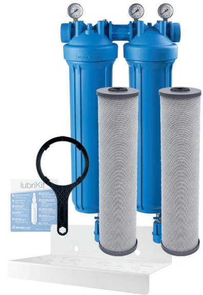
DP BIG Duo Plastic Housing Metal Powder-Coated White Bracket, Filter Wrench, and Lubrikit+ 1-Micron Carbon Block Filter certified to reduce PFOA/PFOS, Chlorine Taste & Odor* and Chemicals*

Check out more about Atlas Filtri at atlasfiltri.com .