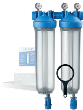
ZA1802745L Gauges and Drain Kit 4 GPM @ 28,000 gallons