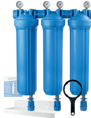
ZA1803737 Gauges and Drain Kit 4 GPM @ 42,000 gallons