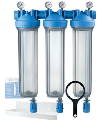
ZA1803745L Gauges and Drain Kit 4 GPM @ 42,000 gallons

Check out all of Atlas Filtri's various solutions and kits to meet the application requirement for your filtration needs at atlasfiltri.com