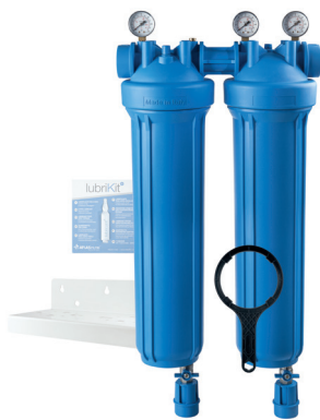
ZA1802746 Gauges and Drain Kit 4 GPM @ 28,000 gallons