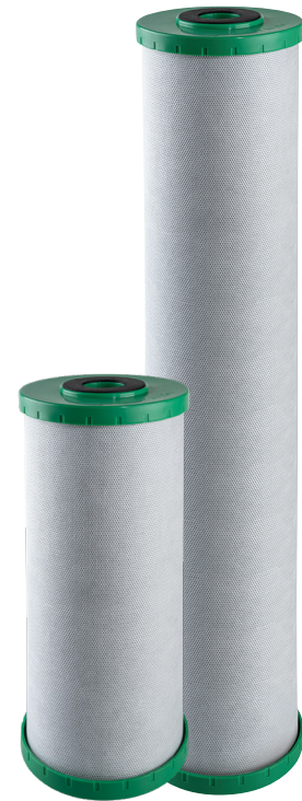
Chloramine Reduction Carbon Block Filter Cartridges RE4510CLM | 4.5" x 10" RE4520CLM | 4.5" x 20" 1-Micron

Check out more about Atlas Filtri at atlasfiltri.com .