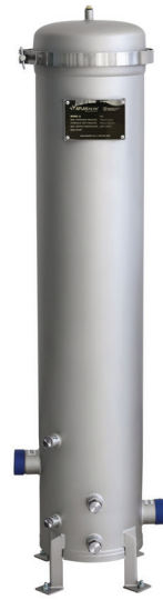
PP5FOS Stainless Steel Housings