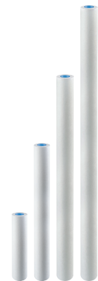
10", 20", 30" and 40" Sediment Filter with ScaleArmor™ Media Filters and Stems Ordered Separately