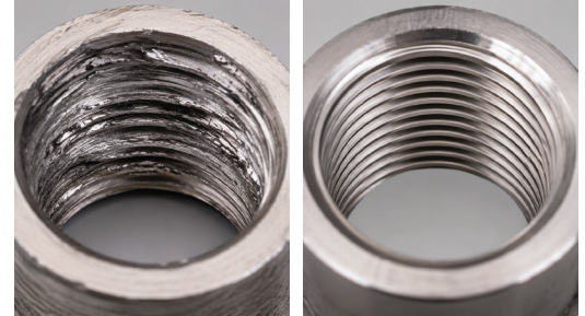
Galled vs. Serviceable Threads

It happens because stainless steel has a protective oxide layer . When you thread two stainless parts together, the friction can scrape that layer off, exposing “naked” metal. Without that barrier, the high spots on the threads physically bond together under pressure, essentially locking them into a single solid piece.