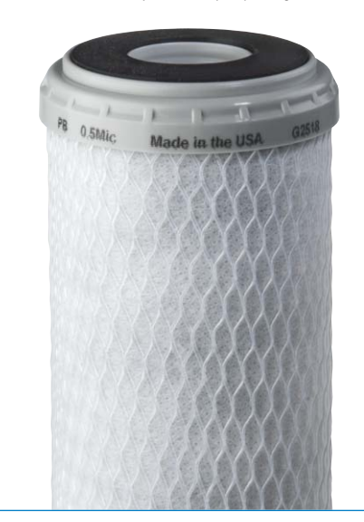
SX Standard double open-ended (DOE) configuration.

CB-AF series is tested and certified by NSF International against NSF/ANSI Standard 42 for materials requirements only.