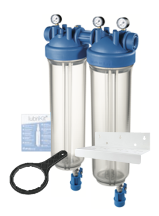
ZA1802745L Gauges and Drain Kit 2 Chloramine Blocks 4 GPM @ 28,000 gallons