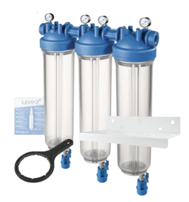
ZA1803745L Gauges and Drain Kit 2 Chloramine Blocks 4 GPM @ 42,000 gallons

Note: DP Big - 1" NPT - 4.5"x 20" – Housing Kits Includes the housing, bracket, wrench, and lubricant. Filter cartridges sold separately.