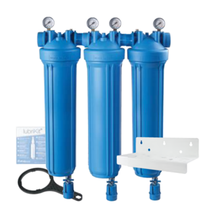
ZA1803737 Gauges and Drain Kit 2 Chloramine Blocks 4 GPM @ 42,000 gallons