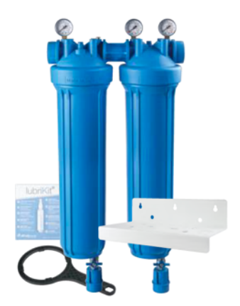
ZA1802746 Gauges and Drain Kit 2 Chloramine Blocks 4 GPM @ 28,000 gallons