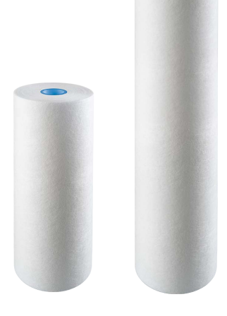
10" and 20" Sediment Filter with ScaleArmor™

Polyphosphate has been tested and certified under ANSI/NSF Standard 42: Drinking Water Treatment Units- Aesthetic Effects ANSI/NSF Standard 60: Drinking Water Treatment Chemicals-Health Effects, for use in potable water systems at concentrations up to 10ppm.