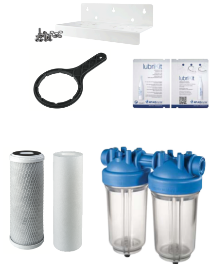
DP Big PET Housing Metal Powder-coated White Bracket Filter Wrench Lubricant