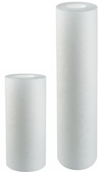
10" and 20" Sediment Filter

Check out more about Atlas Filtri at us.atlasfiltri.com .