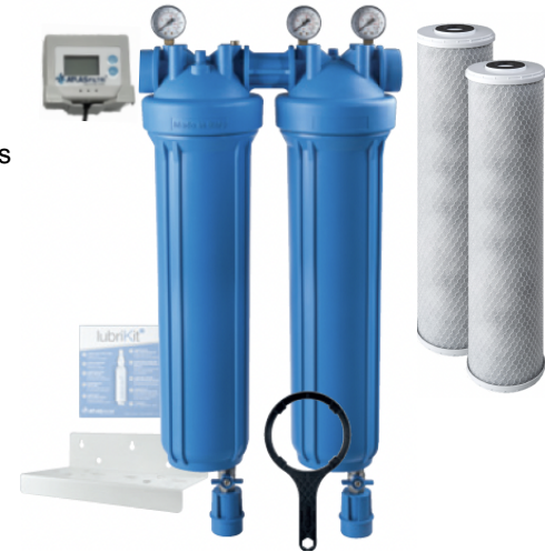
DP Big DUO Plastic Housing Metal Powder-coated White Bracket Filter Wrench and Lubricant

Atlas Filtri is driven to providing our customer with the best available products to meet specific filtration requirements. This is done by using the most advanced manufacturing and design methods. The international patents received come from a constant commitment to research and develop that result in new and innovative products.