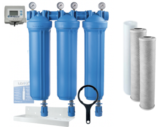
DP Big Trio Plastic Housing Metal Powder Coated White Bracket Filter Wrench and Lubricant